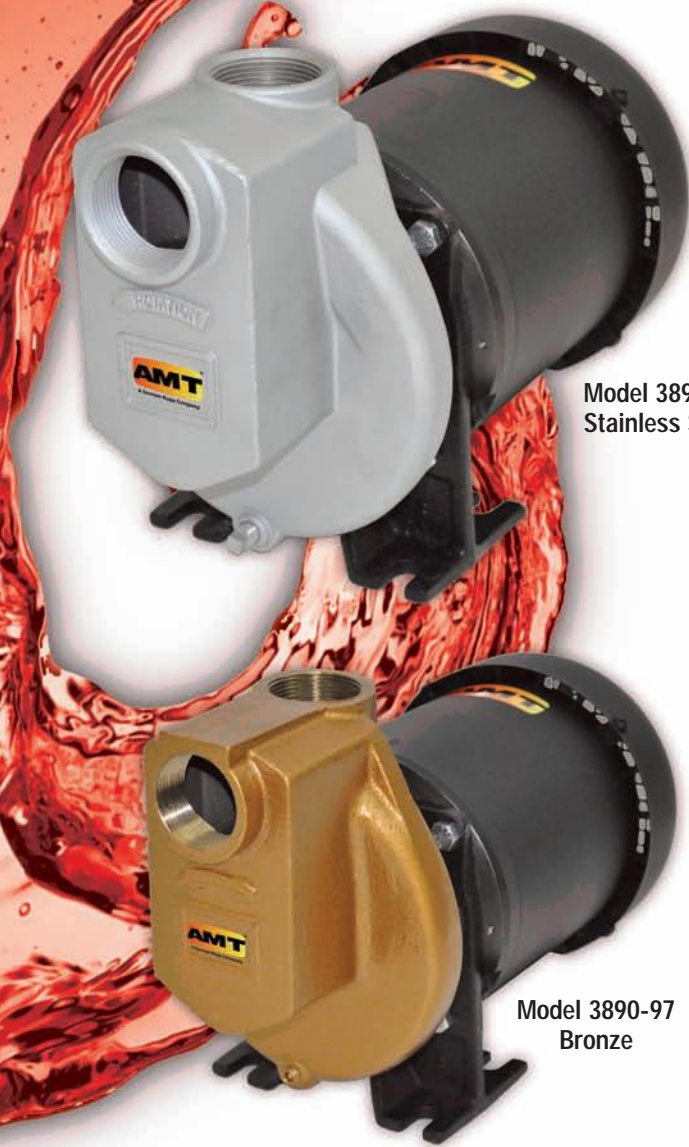
Model 3890-98 Stainless Steel